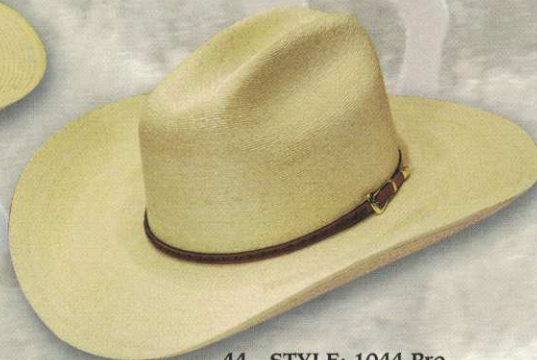
44 STYLE: 1044 Pro MATERIAL: Mexican Fine Palm COLOR: Natural BAND: 873 BRIM: 4" SIZES: 6 3/4 - 7 5/8