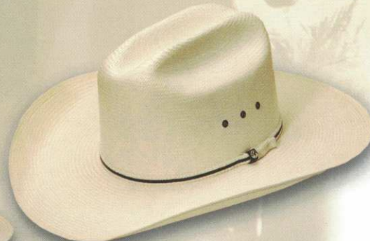
6 STYLE: 1006 Pro-25* MATERIAL: Shantung 2x2 COLOR: Ivory BAND: 856 BRIM: 4" SIZES: 6 5/8 - 7 5/8