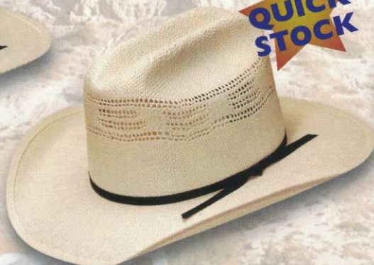
23 STYLE: 1023 Pro Jr-7* MATERIAL: Bangora Neck Vent COLOR: Ivory BAND: 2 Ply BRIM: 3 1/2" SIZES: S/M, L/XL Prepack