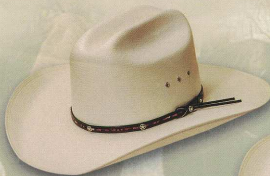
7 STYLE: 1007 Pro-25* MATERIAL: Shantung 2x2 COLOR: Ivory BAND: 848 BRIM: 4" SIZES: 6 5/8 - 7 5/8