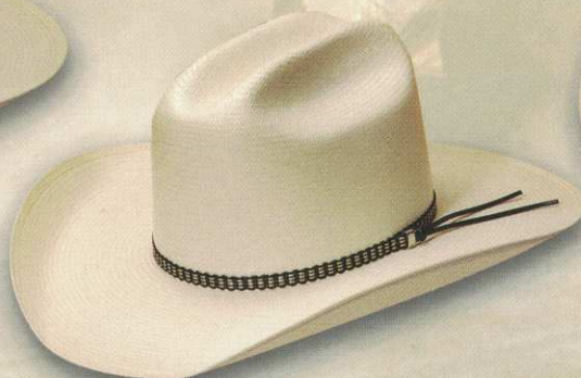
5 STYLE: 1005 Pro-25* MATERIAL: Shantung 2x2 COLOR: Ivory BAND: 279 BRIM: 4" SIZES: 6 5/8 - 7 5/8