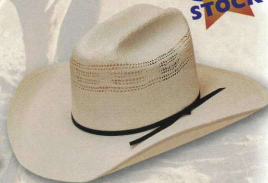
18 STYLE: 1018 Pro-7* MATERIAL: Bangora Neck Vent COLOR: Ivory BAND: 2 Ply BRIM: 4" SIZES: 6 5/8 - 7 5/8