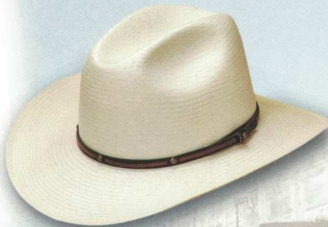
49 STYLE: 1049 Tracker MATERIAL: Panacool COLOR: Ivory BAND: 853 BRIM: 3 1/8" SIZES: 6 5/8 - 7 5/8