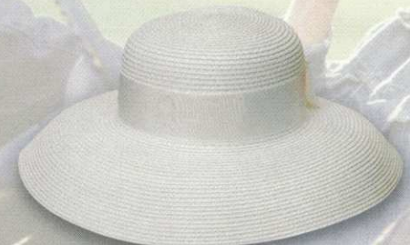
66 STYLE: 1066 Caroline MATERIAL: Viscose Poly Braid COLOR: White BAND: 19 Lgn Butterfly BRIM: 4" SIZES: One Size