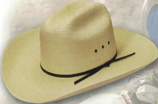
40 STYLE: 1040 Pro MATERIAL: Guatemalon Palm Braid COLOR: Natural BAND: 2 Ply BRIM: 4" SIZES: 6 5/8 - 7 5/8