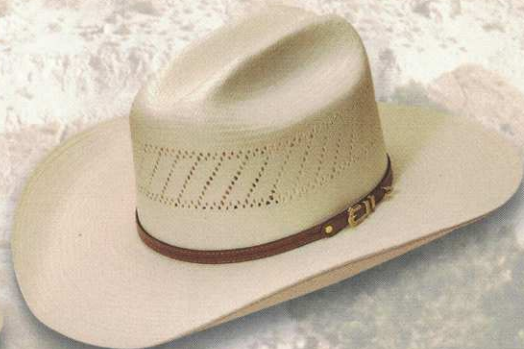
24 STYLE: 1024 Pro-7* MATERIAL: Shantung Neck Vent COLOR: Ivory BAND: 284 BRIM: 4" SIZES: 6 5/8 - 7 5/8