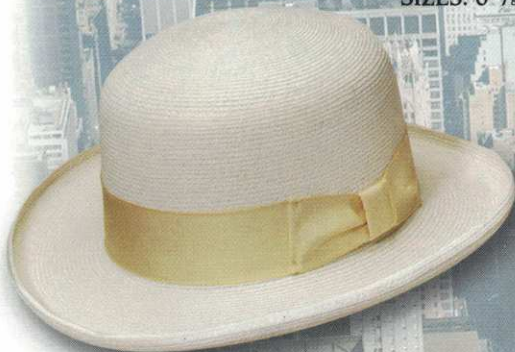
76 STYLE: 1076 Derby MATERIAL: Genuine Milan Braid COLOR: White BAND: 19 Lgn Bow BRIM: 2 1/2" SIZES: 6 3/4 - 7 1/2