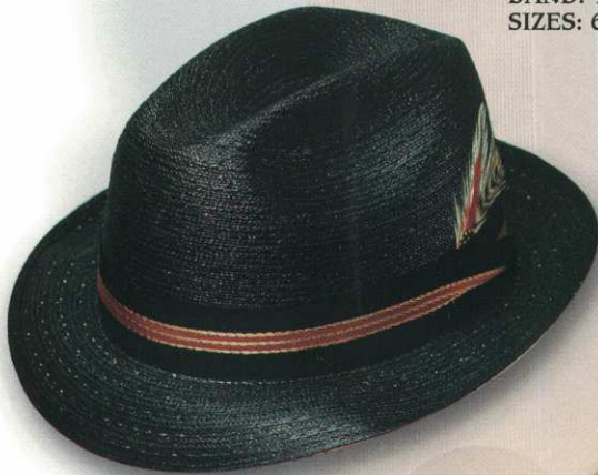
83 STYLE: 1083 Eisenhower MATERIAL: Flicker Braid COLOR: Black BAND: 16 Lgn Sash BRIM: 1 7/8" SIZES: 6 5/8 - 7 3/4