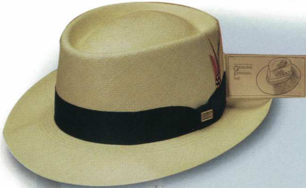
88 STYLE: 1088 Broadway MATERIAL: Genuine Panama COLOR: Semi-Bleached BAND: 16 Lgn Swing BRIM: 2 1/4" SIZES: 6 5/8 - 7 5/8