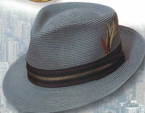
75 STYLE: 1075 Truman MATERIAL: Genuine Milan Braid COLOR: Metal BAND: 16 Lgn Sash BRIM: 2 1/8" SIZES: 6 5/8 - 7 3/4