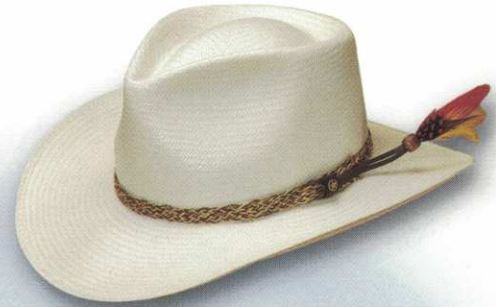
48 STYLE: 1048 Phoenix MATERIAL: Panacool COLOR: Ivory BAND: 903 BRIM: 3 1/8" SIZES: 6 5/8 - 7 5/8