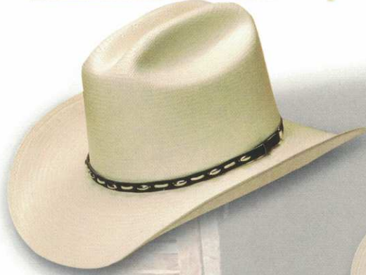
28 STYLE: 1028 Austin-7* MATERIAL: Shantung 2x2 COLOR: Ivory BAND: 270 BRIM: 3 1/2" SIZES: 6 3/4 - 7 5/8