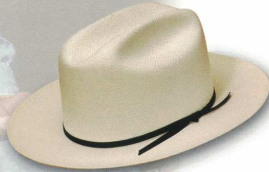
36 STYLE: 1036 Stockman MATERIAL: Panacool COLOR: Ivory BAND: 2 Ply BRIM: 2 3/4" SIZES: 6 5/8 - 7 3/4