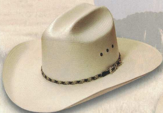
25 STYLE: 1025 Pro-7* MATERIAL: Shantung 2x2 COLOR: Ivory BAND: 282 BRIM: 4" SIZES: 6 5/8 - 7 5/8