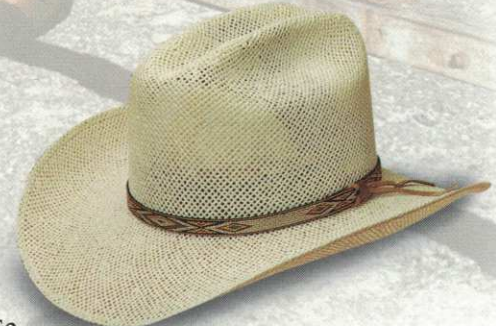
54 STYLE: 1054 Short Go MATERIAL: Twisted Toyo COLOR: Ivory BAND: 181A BRIM: 3 1/2" SIZES: 6 5/8 - 7 5/8