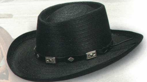
55 STYLE: 1055 Dude MATERIAL: Flicker Braid COLOR: Black BAND: 701 BRIM: 3 1/4" SIZES: 6 3/4 - 7 5/8