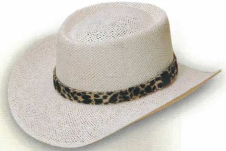
58 STYLE: 1058 Easy Livin MATERIAL: Twisted Toyo COLOR: White BAND: 829 BRIM: 3 1/8" SIZES: S/M, L/XL