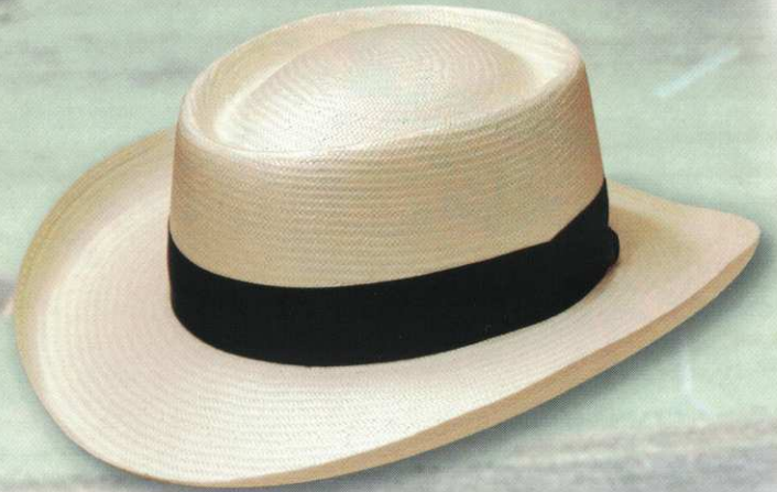
71 STYLE: 1071 Dude MATERIAL: Panacool COLOR: Ivory BAND: 16 Lgn. Sash BRIM: 3 1/8" SIZES: S/M, L/XL