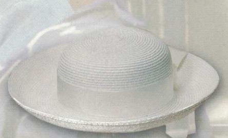
67 STYLE: 1067 Belle MATERIAL: Viscose Poly Braid COLOR: White BAND: 16 Lgn Butterfly BRIM: 3" SIZES: One Size