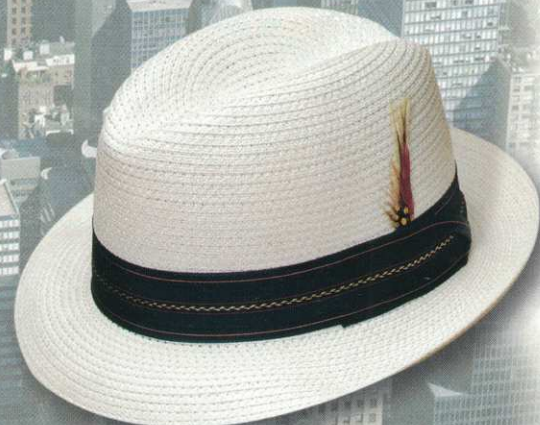
80 STYLE: 1080 Jet MATERIAL: Milanette Braid COLOR: White BAND: 16 Lgn Sash BRIM: 1 7/8" SIZES: 6 5/8 - 7 5/8