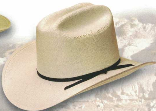
20 STYLE: 1020 Austin-7* MATERIAL: Bangora T-Bird COLOR: Ivory BAND: 2 Ply BRIM: 3 1/2" SIZES: 6 3/4 - 7 5/8