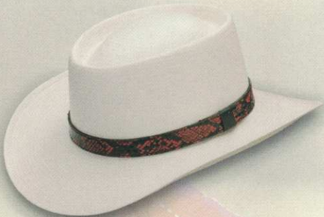
62 STYLE: 1062 Easy Livin MATERIAL: Panacool COLOR: White BAND: 832 BRIM: 3 1/8" SIZES: S/M, L/XL