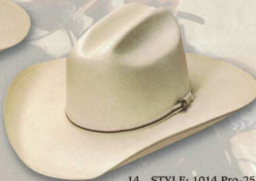
14 STYLE: 1014 Pro-25* MATERIAL: Shantung 1x1 COLOR: Ivory BAND: 857 BRIM: 4" SIZES: 6 5/8 - 7 5/8