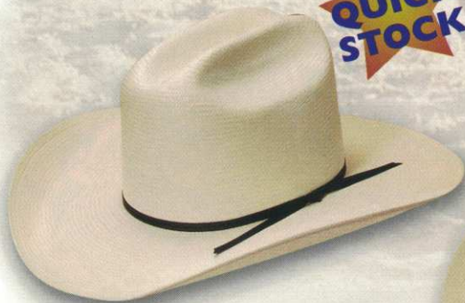
16 STYLE: 1016 Pro-25* MATERIAL: Shantung 2x2 COLOR: Ivory BAND: 2 Ply BRIM: 4" SIZES: 6 5/8 - 7 5/8