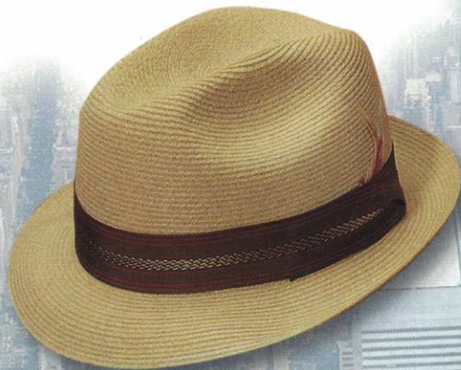
74 STYLE: 1074 Eisenhower MATERIAL: Genuine Milan Braid COLOR: Bamboo BAND: 16 Lgn Sash BRIM: 1 7/8" SIZES: 6 5/8 - 7 3/4