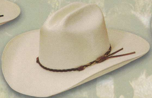
8 STYLE: 1008 Abilene-25* MATERIAL: Shantung 2x2 COLOR: Ivory BAND: 844 BRIM: 4" SIZES: 6 5/8 - 7 5/8