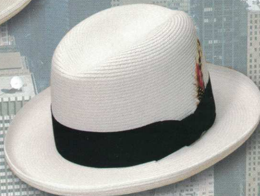
77 STYLE: 1077 Homburg MATERIAL: Genuine Milan Braid COLOR: White BAND: 19 Lgn Bow BRIM: 2 5/8" SIZES: 6 3/4 - 7 5/8