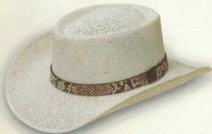
60 STYLE: 1060 Easy Livin MATERIAL: Twisted Toyo COLOR: White BAND: 827 BRIM: 3 1/8" SIZES: S/M, L/XL