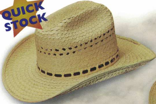
37 STYLE: 1037 Pecos MATERIAL: Farmers Mex. Palm Braid COLOR: Natural BAND: Laced Self BRIM: 3 1/2" SIZES: Prepack Dog, Goat, Hog