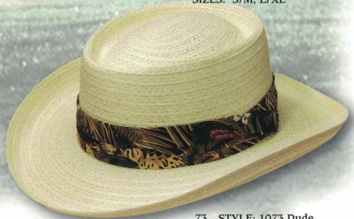
73 STYLE: 1073 Dude MATERIAL: Flicker Braid COLOR: Panama BAND: B910 BRIM: 3 1/8" SIZES: S/M, L/XL