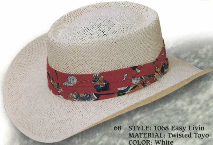
68 STYLE: 1068 Easy Livin MATERIAL: Twisted Toyo COLOR: White BAND: 837 Sash BRIM: 3 1/8" SIZES: S/M, L/XL