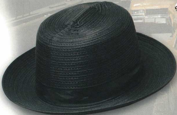
92 STYLE: 1092 Optimo MATERIAL: Flicker Braid COLOR: Black BAND: 12 Lgn Swing BRIM: 2 5/8" SIZES: 6 3/4 - 7 3/4