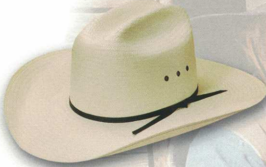
31 STYLE: 1031 Pro MATERIAL: Formosan 2x2 COLOR: Ivory BAND: 2 Ply BRIM: 4" SIZES: 6 3/8 - 7 3/8