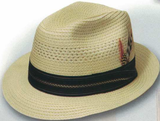
81 STYLE: 1081 Eisenhower MATERIAL: Milanette Braid COLOR: Panama BAND: 16 Lgn Sash BRIM: 1 7/8" SIZES: 6 5/8 - 7 3/4