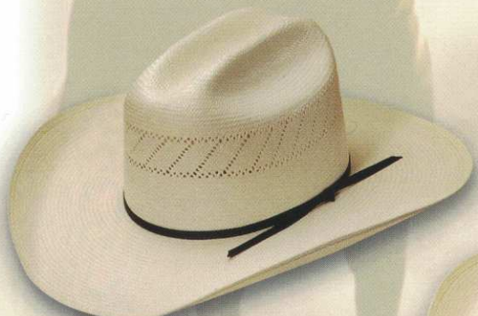
4 STYLE: 1004 Pro-25* MATERIAL: Shantung Neck Vent COLOR: Ivory BAND: 2 Ply BRIM: 4" SIZES: 6 5/8 - 7 5/8