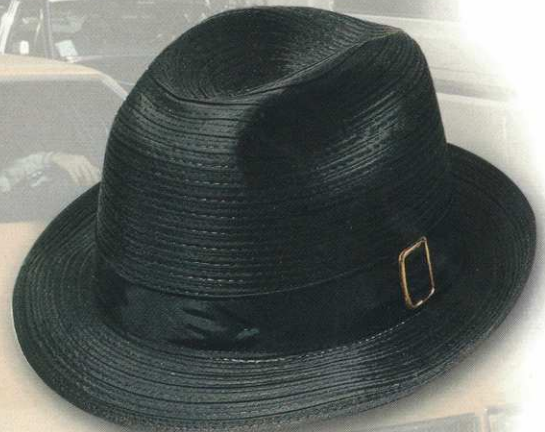
94 STYLE: 1094 Eisenhower MATERIAL: Reemay Braid COLOR: Black BAND: Self BRIM: 1 3/4" SIZES: 6 3/8 - 7 3/4