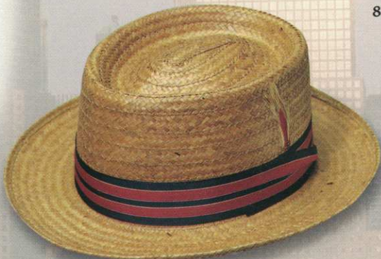
86 STYLE: 1086 Fifth Avenue MATERIAL: Coconut Braid COLOR: Natural BAND: 16 Lgn Sash BRIM: 2 1/4" SIZES: 6 5/8 - 7 1/2