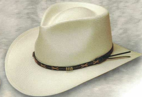
45 STYLE: 1045 Phoenix-25* MATERIAL: Shantung 2x2 COLOR: Ivory BAND: 865 BRIM: 3 1/8" SIZES: 6 5/8 - 7 5/8