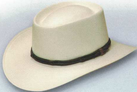
47 STYLE: 1047 Easy Livin-25° MATERIAL: Shantung 2x2 COLOR: Ivory BAND: 274 BRIM: 3 1/8" SIZES: 6 5/8 - 7 5/8