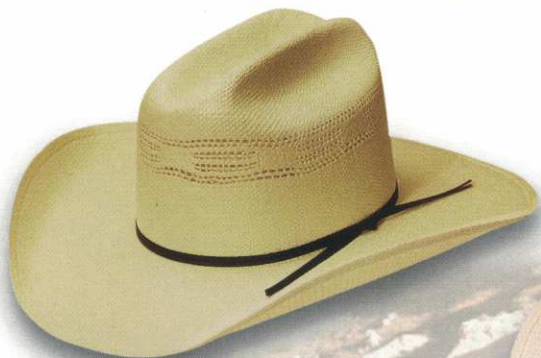
19 STYLE: 1019 Pro-7* MATERIAL: Bangora Neck Vent COLOR: Cream BAND: 2 Ply BRIM: 4" SIZES: 6 5/8 - 7 5/8