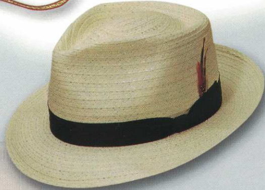
82 STYLE: 1082 Truman MATERIAL: Flicker Braid COLOR: Panama BAND: 12 Lgn Swing BRIM: 2 1/4" SIZES: 6 5/8 - 7 3/4