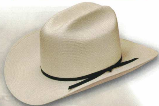
12 STYLE: 1012 Rancher-25* MATERIAL: Shantung 2x2 COLOR: Ivory BAND: 2 Ply BRIM: 3 1/2" SIZES: 6 3/4 - 7 3/4