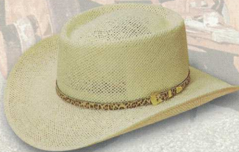
53 STYLE: 1053 Easy Livin MATERIAL: Twisted Toyo COLOR: Ivory BAND: 288 BRIM: 3 1/8" SIZES: 6 5/8 - 7 5/8