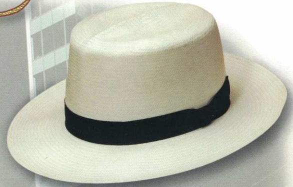
89 STYLE: 1089 Optimo MATERIAL: Panacool COLOR: Ivory BAND: 12 Lgn Swing BRIM: 2 3/4" SIZES: 6 3/4 - 7 3/4