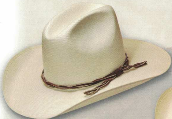
13 STYLE: 1013 Bronco-25* MATERIAL: Shantung 2x2 COLOR: Ivory BAND: B1 BRIM: 4" SIZES: 6 3/4 - 7 5/8