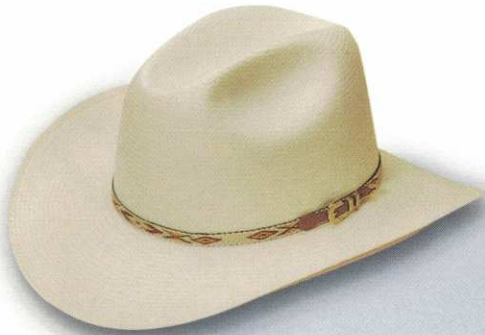
46 STYLE: 1046 Tracker-25° MATERIAL: Shantung 2x2 COLOR: Ivory BAND: 278 BRIM: 3 1/8" SIZES: 6 5/8 - 7 5/8