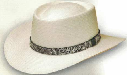
61 STYLE: 1061 Easy Livin MATERIAL: Panacool COLOR: White BAND: 833 BRIM: 3 1/8" SIZES: S/M, L/XL