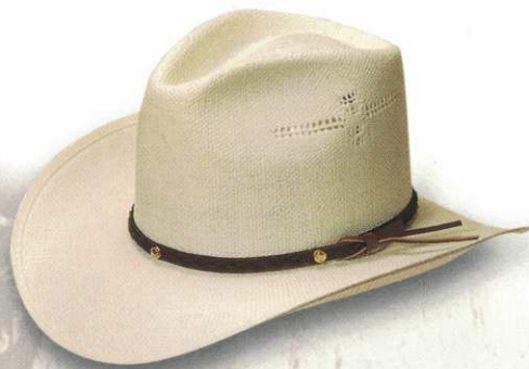
21 STYLE: 1021 Duke-7* MATERIAL: Bangora T-Bird COLOR: Ivory BAND: 859 BRIM: 3 1/2" SIZES: 6 3/4 - 7 5/8