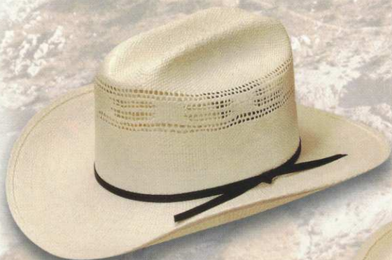
22 STYLE: 1022 Rancher-7* MATERIAL: Bangora Neck Vent COLOR: Ivory BAND: 2 Ply BRIM: 3 1/2" SIZES: 6 3/4 - 7 5/8