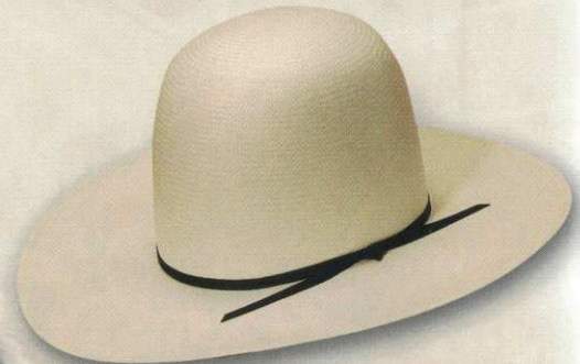
15 STYLE: 1015 Open Crown-25* MATERIAL: Shantung 2x2 COLOR: Ivory BAND: 2 Ply BRIM: 4", 4 1/2", 4 3/4" SIZES: 6 3/4 - 7 5/8