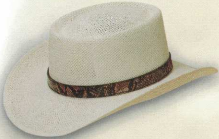
59 STYLE: 1059 Easy Livin MATERIAL: Twisted Toyo COLOR: White BAND: 831 BRIM: 3 1/8" SIZES: S/M, L/XL