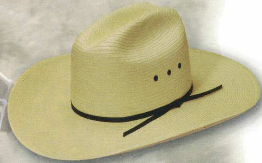
42 STYLE: 1042 Pro Jr. MATERIAL: Guatemalon Palm Braid COLOR: Natural BAND: 2 Ply BRIM: 3 1/2" SIZES: 6 1/4 - 6 7/8