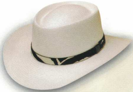
56 STYLE: 1056 Easy Livin MATERIAL: Panacool COLOR: White BAND: 830 BRIM: 3 1/8" SIZES: S/M, L/XL