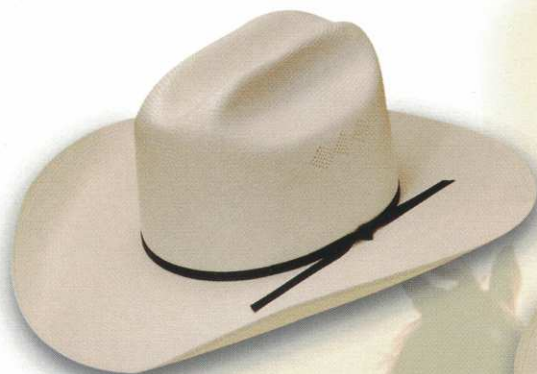
1 STYLE: 1001 Pro-50* MATERIAL: Shantung Diamond Vent COLOR: Ivory BAND: 2 Ply BRIM: 4" SIZES: 6 5/8 - 7 5/8