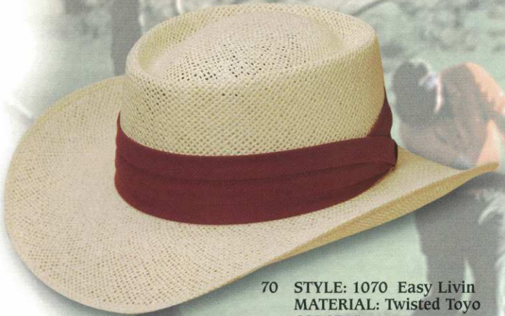
70 STYLE: 1070 Easy Livin MATERIAL: Twisted Toyo COLOR: Ivory BAND: 3 Plt. Sash BRIM: 3 1/8" SIZES: S/M, L/XL