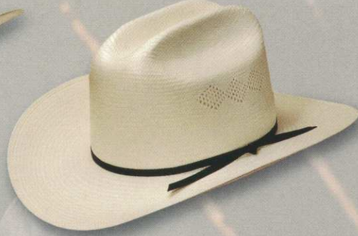
29 STYLE: 1029 Rancher-7* MATERIAL: Shantung Diamond Vent COLOR: Ivory BAND: 2 Ply BRIM: 3 1/2" SIZES: 6 3/4 - 7 3/4