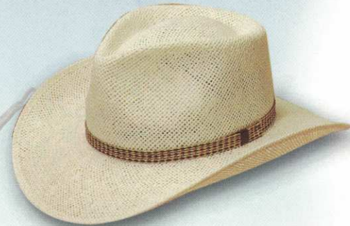
51 STYLE: 1051 Phoenix MATERIAL: Twisted Toyo COLOR: Ivory BAND: 293 BRIM: 3 1/8" SIZES: 6 5/8 - 7 5/8