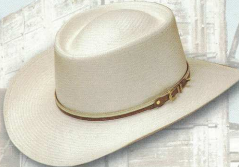
50 STYLE: 1050 Easy Livin MATERIAL: Panacool COLOR: Ivory BAND: 285 BRIM: 3 1/8" SIZES: 6 5/8 - 7 5/8