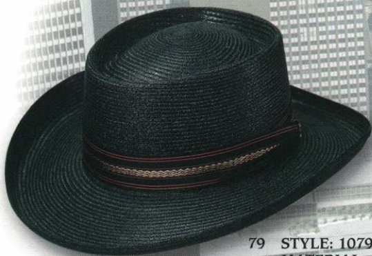
79 STYLE: 1079 Dude MATERIAL: Genuine Milan Braid COLOR: Black BAND: 16 Lgn Sash BRIM: 3 1/8" SIZES: 6 7/8 - 7 5/8