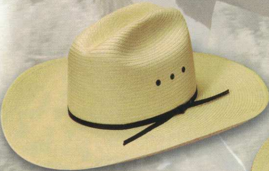
43 STYLE: 1043 Pro MATERIAL: Mexican Fine Palm COLOR: Natural BAND: 2 Ply BRIM: 4" SIZES: 6 5/8 - 7 5/8