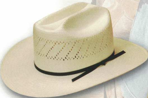
34 STYLE: 1034 Dogger MATERIAL: Formosan Neck Vent COLOR: Ivory BAND: 2 Ply BRIM: 3 1/4" SIZES: 6 3/4 - 7 5/8