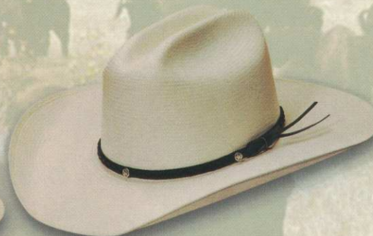
9 STYLE: 1009 Abilene-25* MATERIAL: Shantung 2x2 COLOR: Ivory BAND: 864 BRIM: 4" SIZES: 6 5/8 - 7 5/8