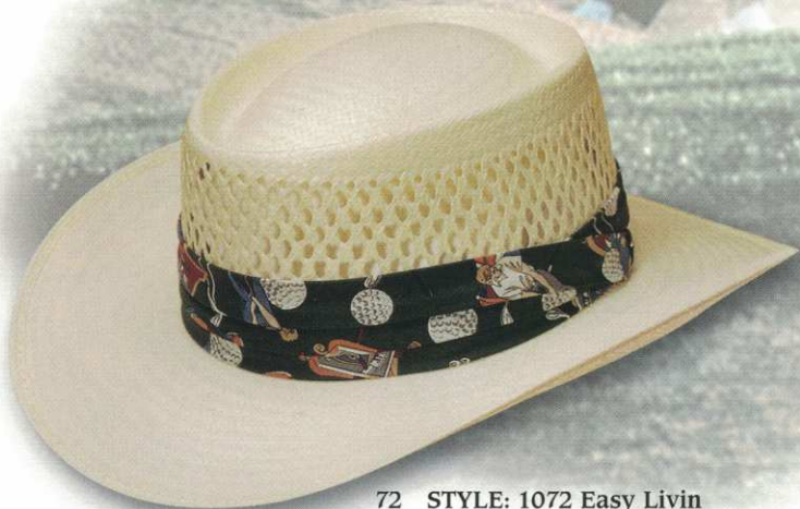
72 STYLE: 1072 Easy Livin MATERIAL: Panacool Neck Vent COLOR: Ivory BAND: 901 Sash BRIM: 3 1/8" SIZES: S/M, L/XL