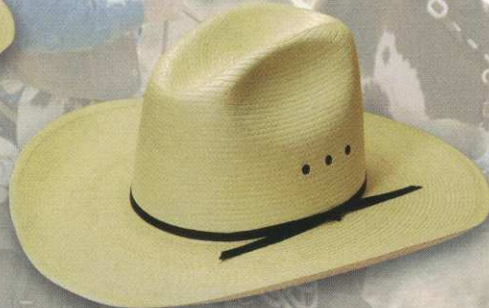
41 STYLE: 1041 Bronco MATERIAL: Guatemalon Palm Braid COLOR: Natural BAND: 2 Ply BRIM: 4" SIZES: 6 3/4 - 7 5/8