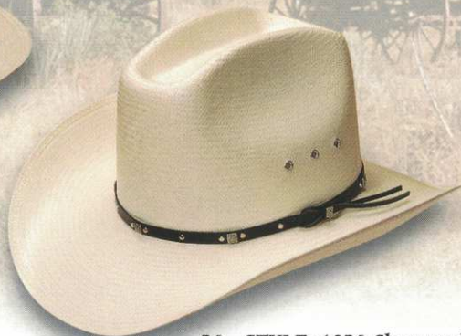
26 STYLE: 1026 Chaparral-7* MATERIAL: Shantung 2x2 COLOR: Ivory BAND: 836 BRIM: 3 1/2" SIZES: 6 3/4 - 7 1/2