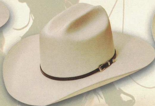
2 STYLE: 1002 Pro-50* MATERIAL: Shantung 2x2 COLOR: Ivory BAND: 876 BRIM: 4" SIZES: 6 5/8 - 7 5/8