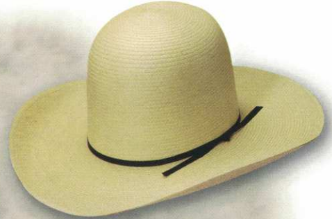
39 STYLE: 1039 Open Crown MATERIAL: Guatemalon Palm Braid COLOR: Natural BAND: 2 Ply BRIM: 4" SIZES: 6 3/4 - 7 5/8