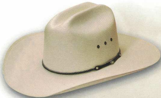
10 STYLE: 1010 Abilene-25* MATERIAL: Shantung 2x2 COLOR: Ivory BAND: 276 BRIM: 4" SIZES: 6 5/8 - 7 5/8