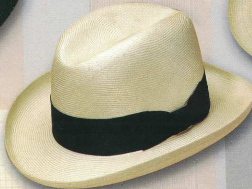
85 STYLE: 1085 Homberg MATERIAL: Paribuntal COLOR: Natural BAND: 19 Lgn Bow BRIM: 2 5/8" SIZES: 6 3/4 - 7 5/8