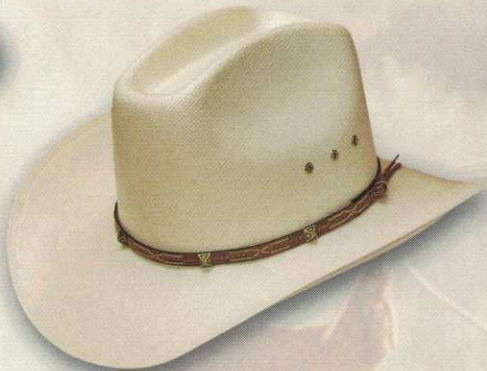
11 STYLE: 1011 Chaparral-25* MATERIAL: Shantung 1x1 COLOR: Ivory BAND: 847 BRIM: 3 1/2" SIZES: 6 3/4 - 7 1/2