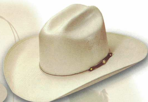
3 STYLE: 1003 Pro-25* MATERIAL: Shantung Diamond Vent COLOR: Ivory BAND: 277 BRIM: 4" SIZES: 6 5/8 - 7 5/8