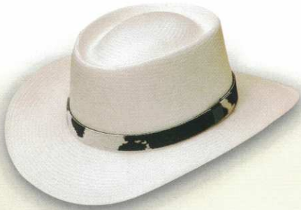
57 STYLE: 1057 Easy Livin MATERIAL: Panacool COLOR: White BAND: 828 BRIM: 3 1/8" SIZES: S/M, L/XL