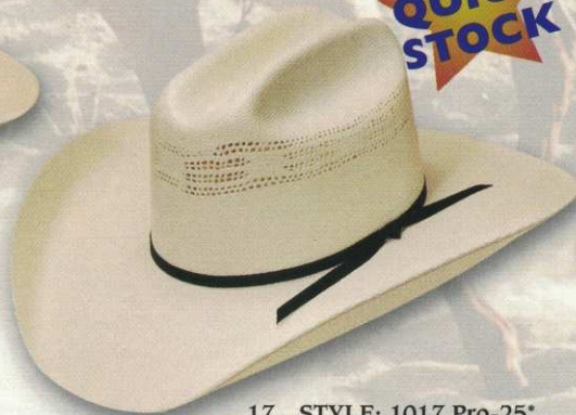
17 STYLE: 1017 Pro-25* MATERIAL: Bangora Neck Vent COLOR: Ivory BAND: 2 Ply BRIM: 4" SIZES: 6 5/8 - 7 5/8