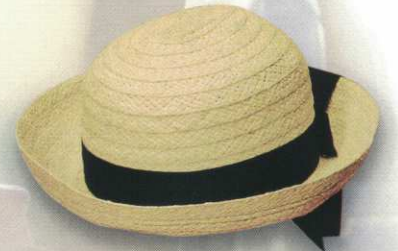
64 STYLE: 1064 Belle MATERIAL: Raffia Braid COLOR: Natural BAND: 16 Lgn Butterfly BRIM: 3" SIZES: One Size