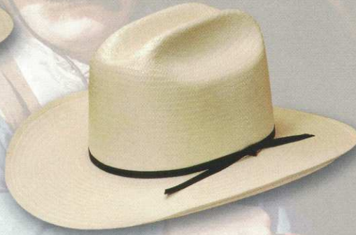
32 STYLE: 1032 Pecos MATERIAL: Formosan 2x2 COLOR: Ivory BAND: 2 Ply BRIM: 3 1/2" SIZES: 6 3/4 - 7 5/8