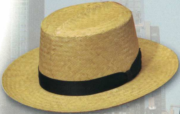
90 STYLE: 1090 Optimo MATERIAL: Raffia Body COLOR: Natural BAND: 12 Lgn Swing BRIM: 2 3/4" SIZES: 6 3/4 - 7 3/4