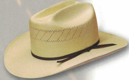
33 STYLE: 1033 Dogger-7* MATERIAL: Shantung Neck Vent COLOR: Wheat BAND: 2 Ply BRIM: 3 1/4" SIZES: 6 3/4 - 7 5/8