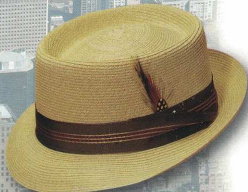
78 STYLE: 1078 Fifth Ave. MATERIAL: Genuine Milan Braid COLOR: Bamboo BAND: 16 Lgn Sash BRIM: 2" SIZES: 6 5/8 - 7 1/2