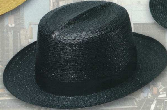
91 STYLE: 1091 Optimo MATERIAL: Milanette Braid COLOR: Black BAND: 12 Lgn Swing BRIM: 2 3/4" SIZES: 6 3/4 - 7 3/4