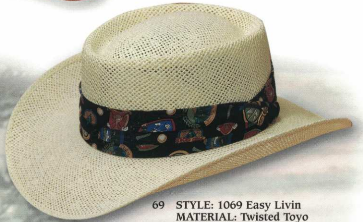
69 STYLE: 1069 Easy Livin MATERIAL: Twisted Toyo COLOR: Ivory BAND: 836 Sash BRIM: 3 1/8" SIZES: S/M, L/XL