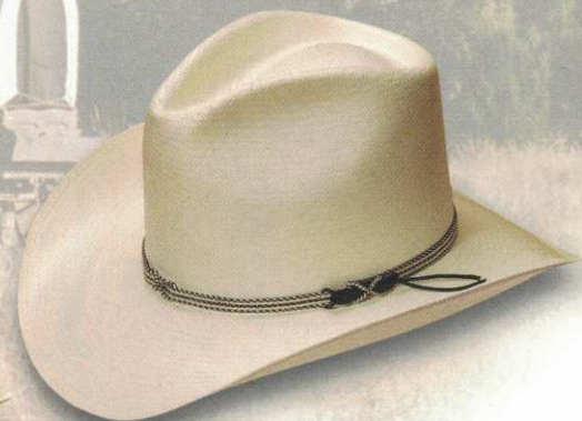
27 STYLE: 1027 Duke-7* MATERIAL: Shantung 2x2 COLOR: Ivory BAND: 281 BRIM: 3 1/2" SIZES: 6 3/4 - 7 5/8