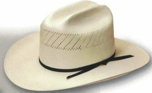
30 STYLE: 1030 Pecos-7* MATERIAL: Shantung Neck Vent COLOR: Ivory BAND: 2 Ply BRIM: 3 1/2" SIZES: 6 3/4 - 7 5/8