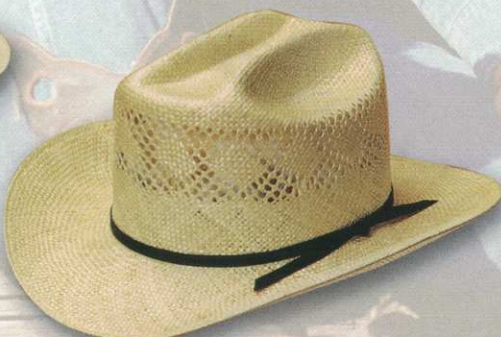
35 STYLE: 1035 Dogger MATERIAL: Sisal Vented COLOR: Ivory BAND: 2 Ply BRIM: 3" SIZES: 6 3/4 - 7 5/8