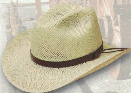
52 STYLE: 1052 Tracker MATERIAL: Twisted Toyo COLOR: Ivory BAND: 111 BRIM: 3 1/8" SIZES: 6 5/8 - 7 5/8