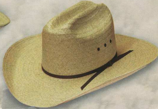
38 STYLE: 1038 Pro MATERIAL: Toyo Braid COLOR: Tan BAND: 2 Ply BRIM: 4" SIZES: 6 5/8 - 7 5/8